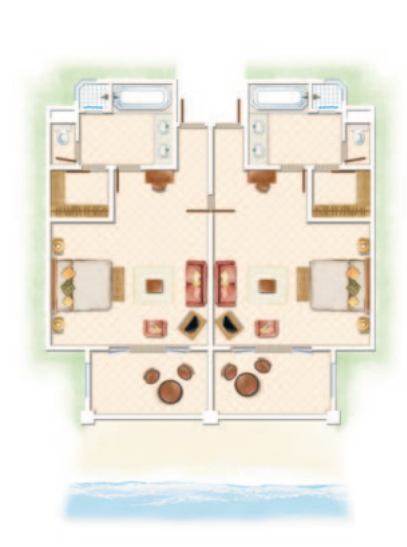
Deluxe Family Apartment