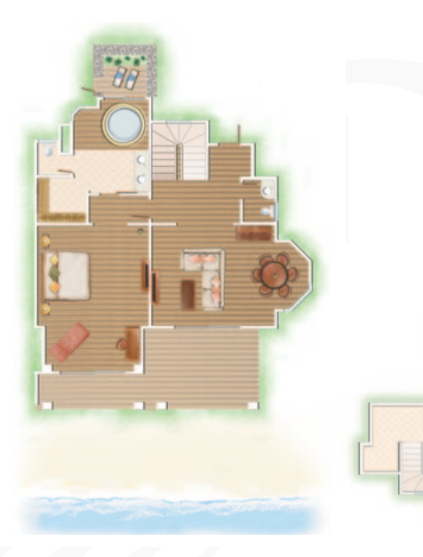
2-Bedroom Family Suite